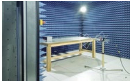
EMC测量屏蔽室 EMC measuring chamber

The testing laboratory at the Győr location enables Melecs EWS to quickly and reliably test products in product development and mass production. The test activities are directly integrated into the product development process. Our own testing laboratory offers a high degree of flexibility and thus the possibility of implementing environmental tests of any kind as quickly as possible.