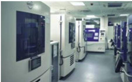
800升 环境试验箱 Climatic cabinets 800L

美乐科斯杰尔工厂有自己的测试实验室, 能在产品研发、产品验证以及批量生产阶段进行快速可靠的产品测试。产品测试直接融合在产品开发过程中。企业内部实验室为产品研发提供高度灵活性, 能够尽可能缩短测试和验证时间。